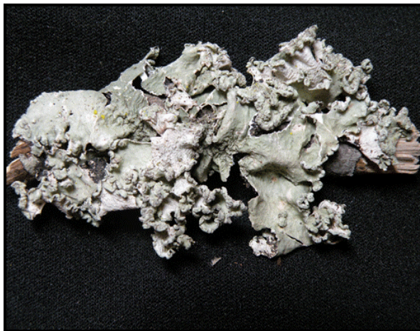
21. Parmotrema austrosinense