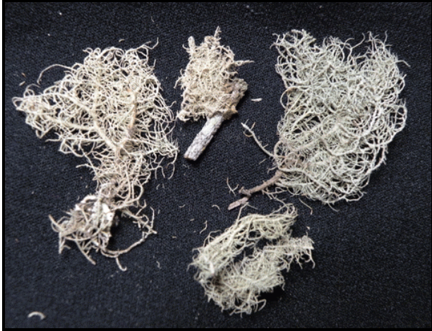
27. Usnea spp.