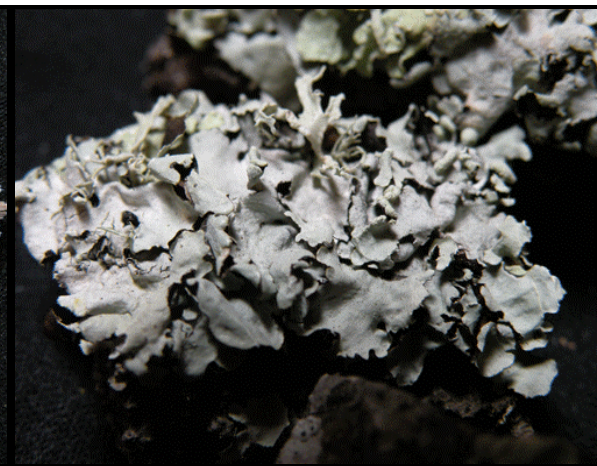
22. Parmotrema perlatum