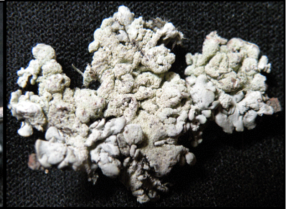
12. Heterogymnia tubulosa