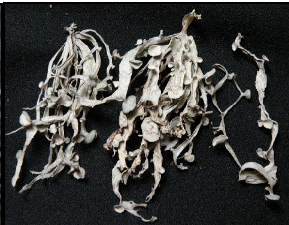
24. Ramalina leptocarpha