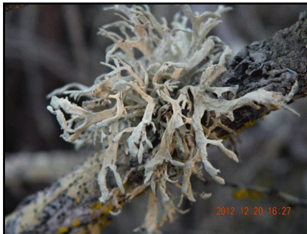
5. Evernia prunastri