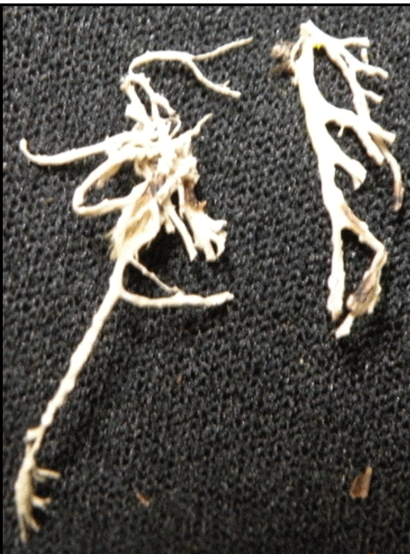
26. Ramalina subleptocarpha