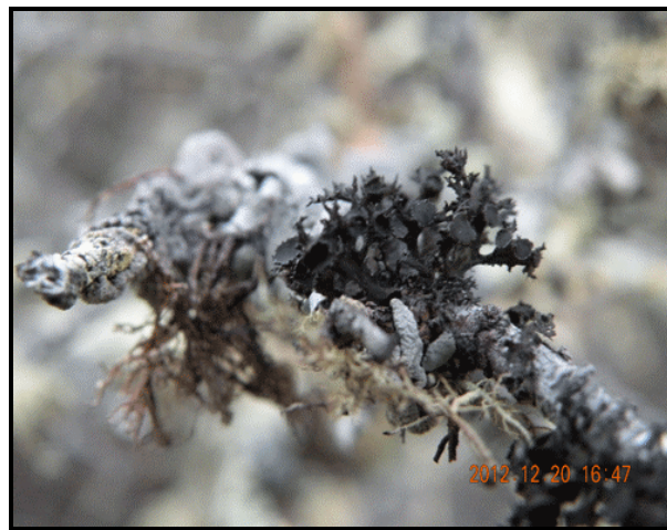
13. Kaernifeltia merrillii