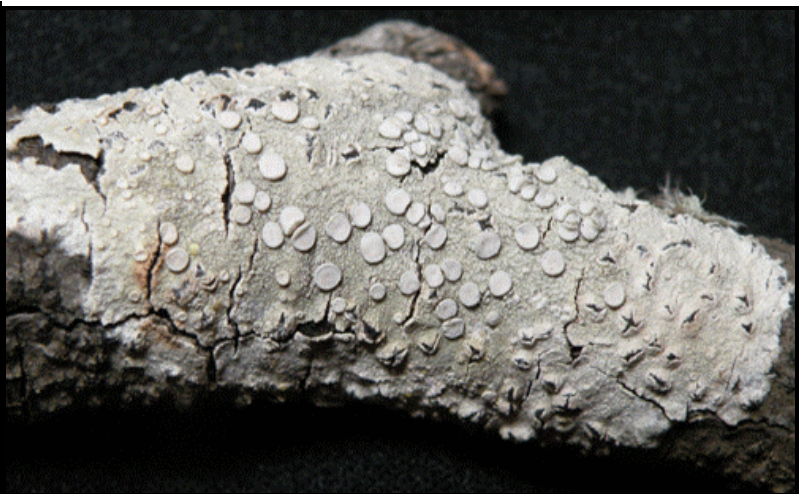
18. Ochrolechia sp.