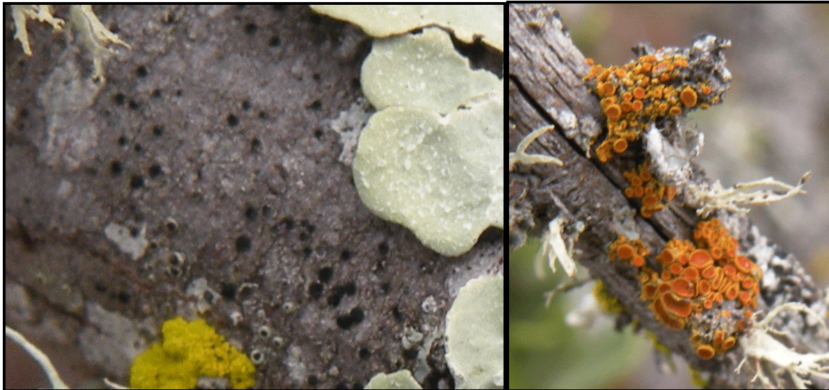
1. Buellia sp.