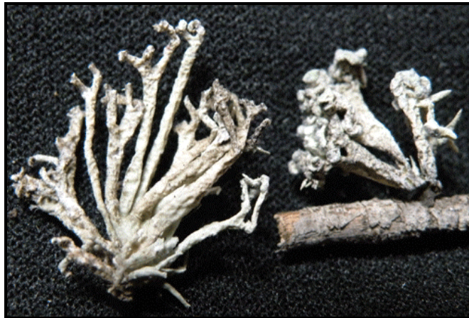
15. Niebla cephalota