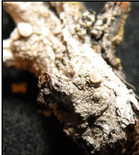
17. Ochrolechia sp.