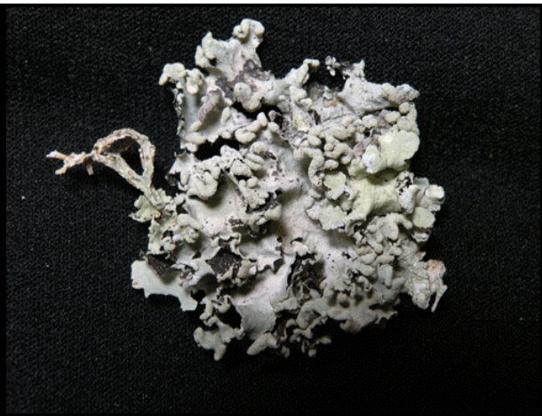
20. Parmotrema arnoldii