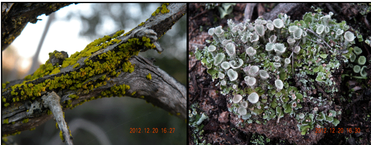
3. Chrysothrix xanthina