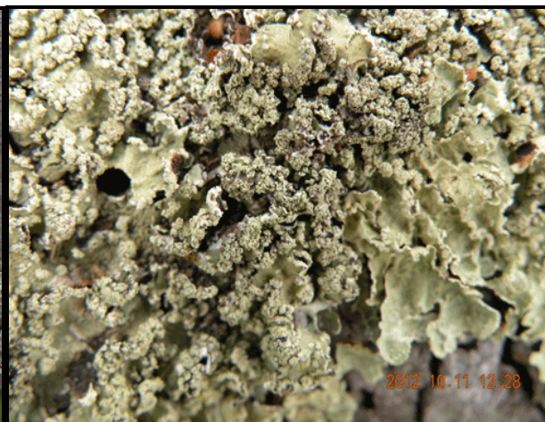
7 & 8. Flavoparmelia flaventior