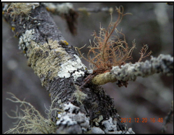
28. Usnea rubicunda