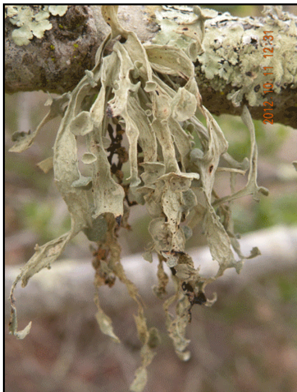
25. Ramalina leptocarpha