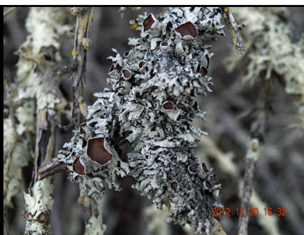
10. Hypogymnia heterophylla