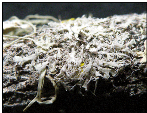
9. Heterodermia leucomelaena