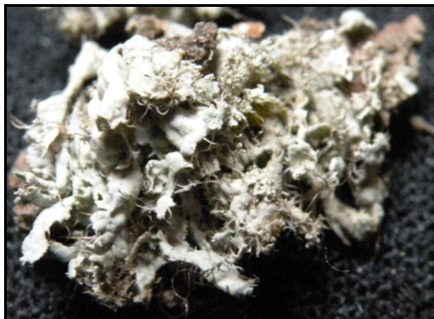
23. Phycia tenella