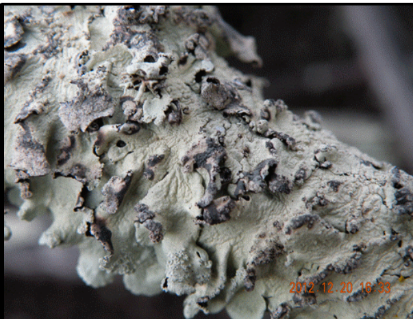
6. Flavoparmelia caperata