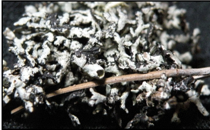
11. Hypogymnia imshaugii