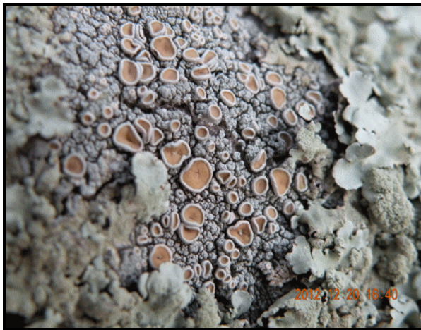
19. Ochrolechia sp.