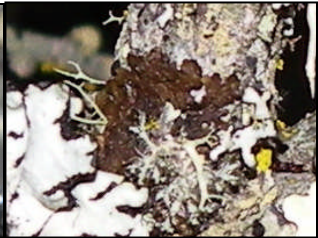
14. Melanelia sp.